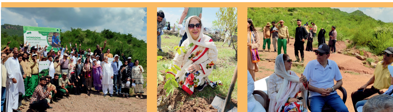
Glimpses from CAF's Plantation Drive on Trail 7; 4 th September, 2025

The initiative builds on HRDN's ongoing commitment to nature-based solutions and sustained climate-responsive practices.