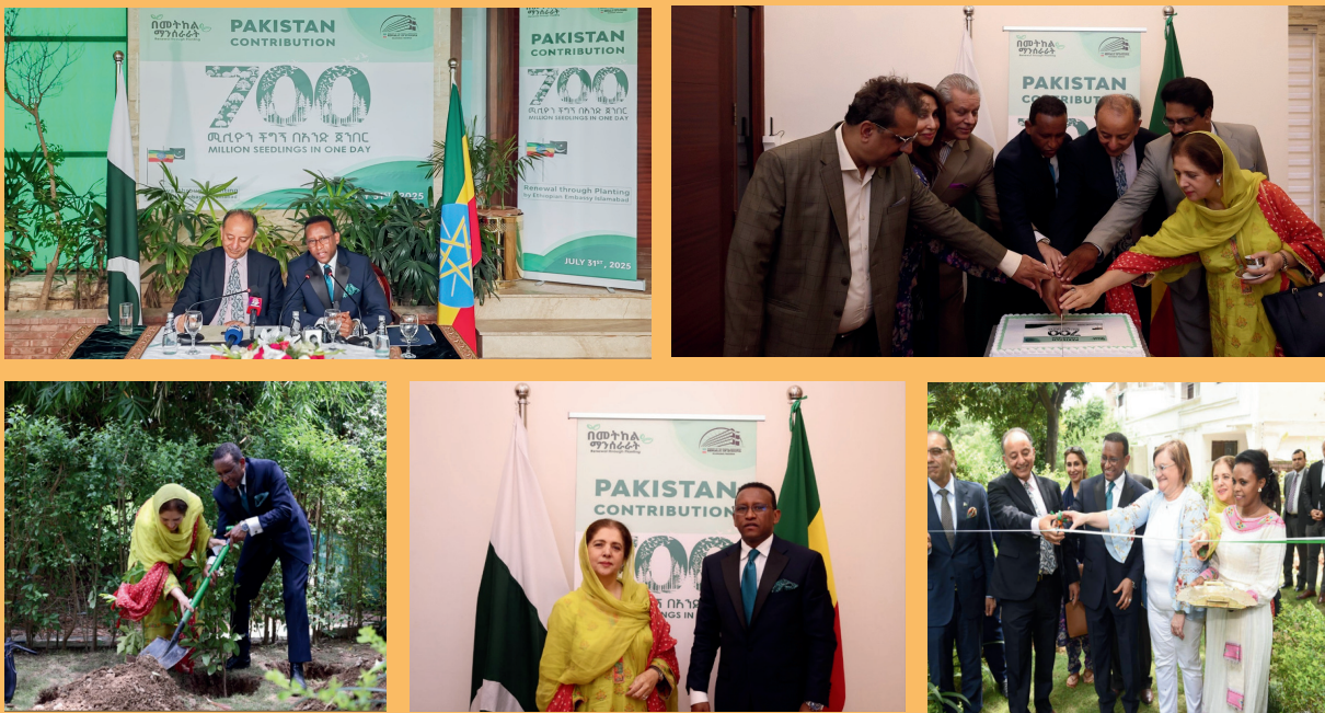
Glimpses from Ethiopian Embassy's Plantation drive; 4 th August, 2025

HRDN Pakistan proudly participated and donated fruit plants in a plantation drive on 4 th August 2025, organised by the Embassy of Ethiopia in Islamabad, supporting Ethiopia's Green Legacy Initiative. The event was attended by Federal Minister for Climate Change Dr Musadik Malik, diplomats, government officials and civil society representatives. HRDN remains committed to climate action and will continue engaging youth and communities in future plantation initiatives.