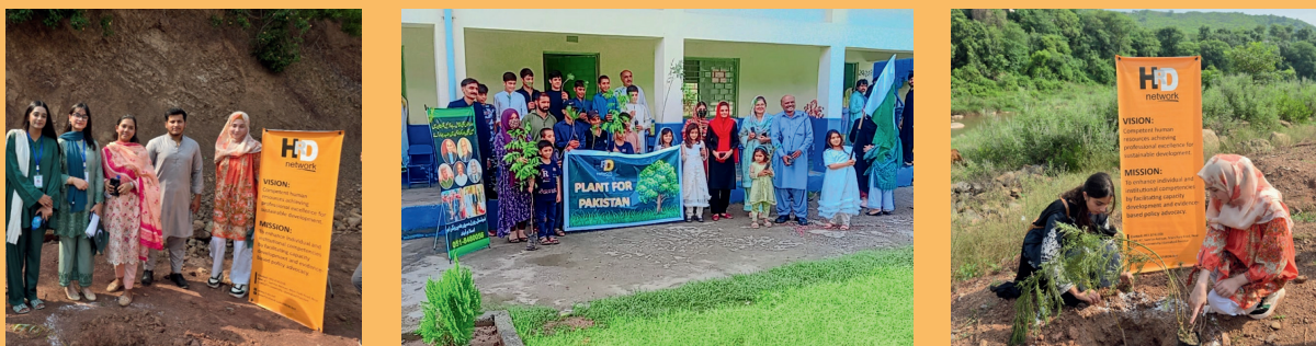
Glimpses from NRSP's Plantation drive on 8 th , 18 th August, 2025

HRDN, in collaboration with NRSP Rawalpindi Region, organised the Plant for Pakistan Plantation Drive on 8 th and 18 th August 2025 in Tameer ICT. The initiative fostered meaningful engagement between community youth and HRDN Summer Interns, who collectively participated in plantation activities to promote environmental sustainability.