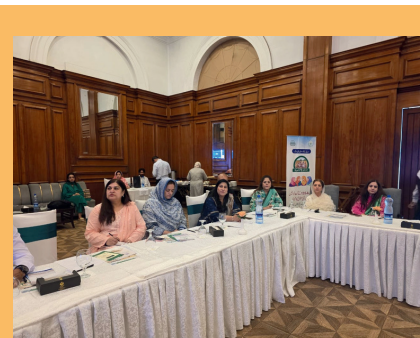
Glimpses from the Focus Group Discussion (PULSE); 1 st July 2025