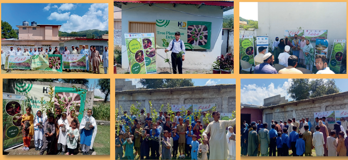
Glimpses from GBTI’s Plantation drive at Haripur; 5th September, 2025

HRDN, in collaboration with GBTI, continued with its plantation drives, engaging communities, teachers, and students to advance inclusive climate action. The “Ek Shajar, Ek Beti” initiative in schools highlighted the central role of girls and women in environmental stewardship.