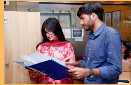
Glimpses from the engaging session of The Summer Internship Program 2025