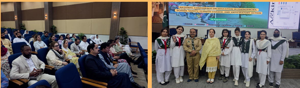
Meaningful engagement and contributing to collective action for resilient education systems.