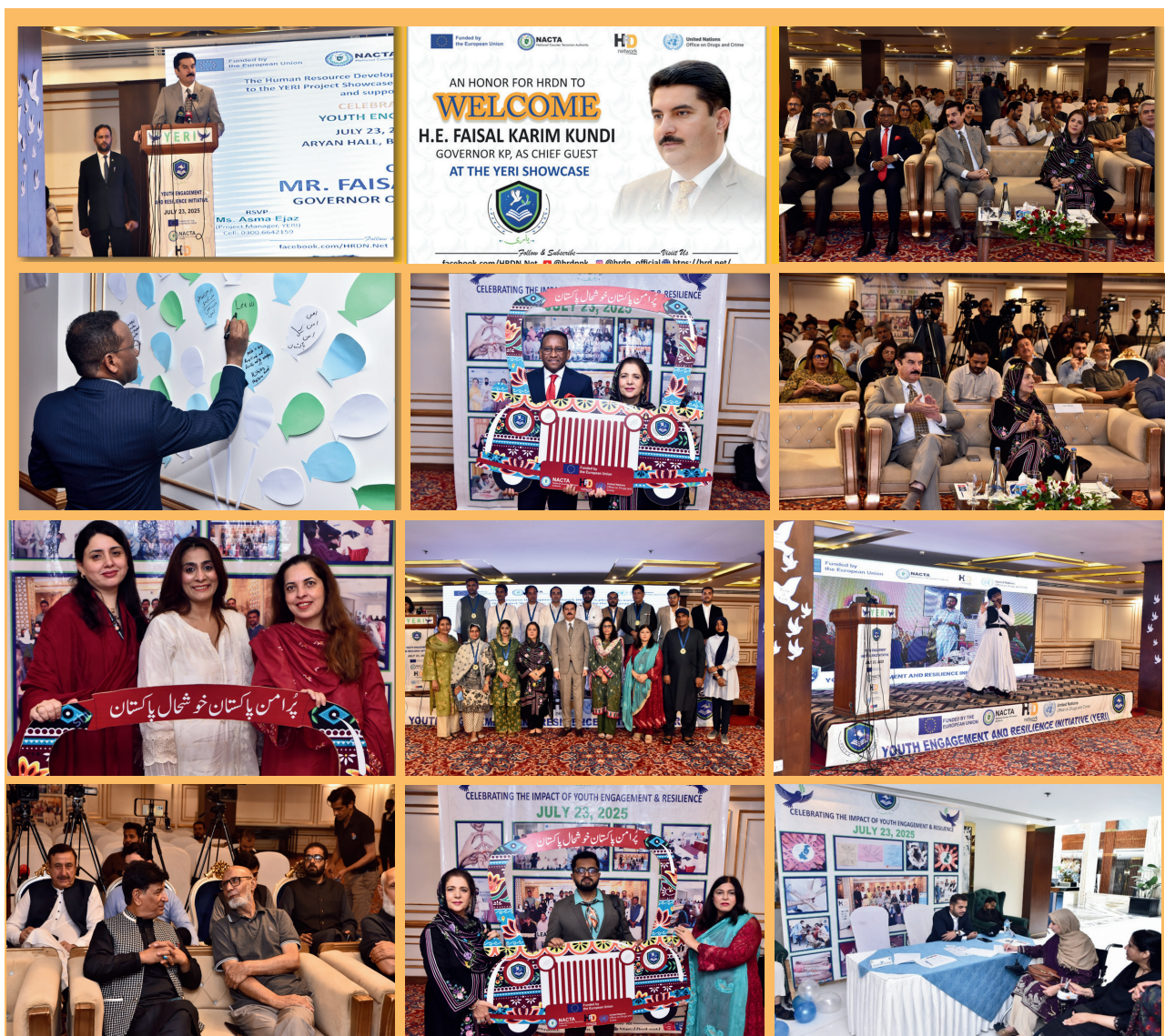
Glimpses from the project closing ceremony at Best western Hotel, Islamabad; 23 rd July, 2025