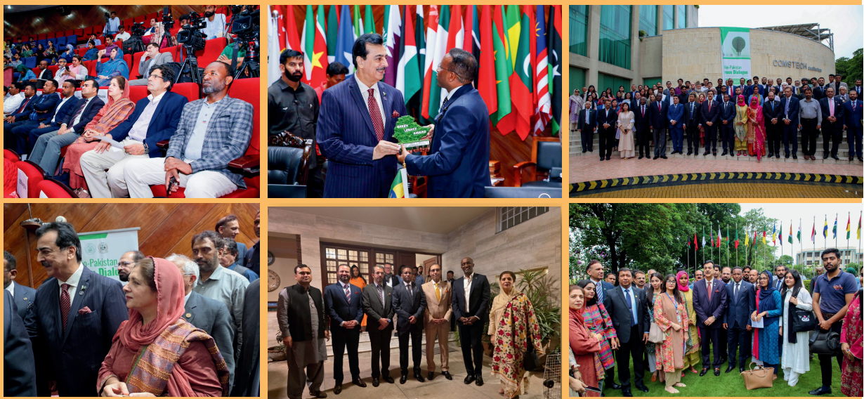
Glimpses from the Ethio-Pak Green Dialogue at COMSTECH; 18 th August 2025

HRDN, along with its group of interns, participated in the Ethio-Pakistan Green Dialogue held at COMSTECH on August 18, 2025. The event brought together youth from Ethiopia and Pakistan to facilitate an exchange of experiences and best practices, with a particular focus on Ethiopia's Green Legacy Initiative. The dialogue was attended by Chairman Senate Mr Yousaf Raza Gillani as Chief Guest and featured participation from ambassadors, representatives of academia, UN agencies, the Rawalpindi Chamber of Commerce, and civil society, highlighting the significance of collaboration and partnerships in advancing sustainability and climate action.