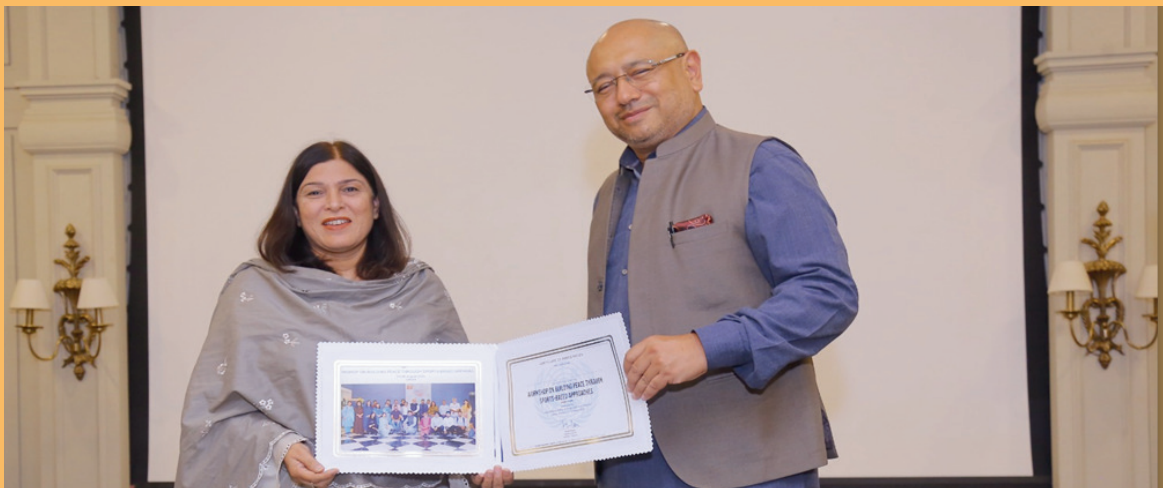
Participation as a strategic partner in UNODC-led training initiatives on prevention and resilience.