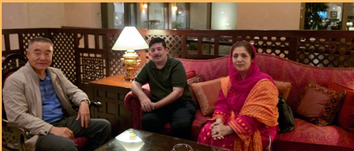
Glimpse from the meetup: 21 st August 2025