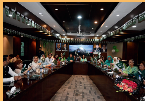
Glimpses from Independence Day Celebrations; 12 August, 2025