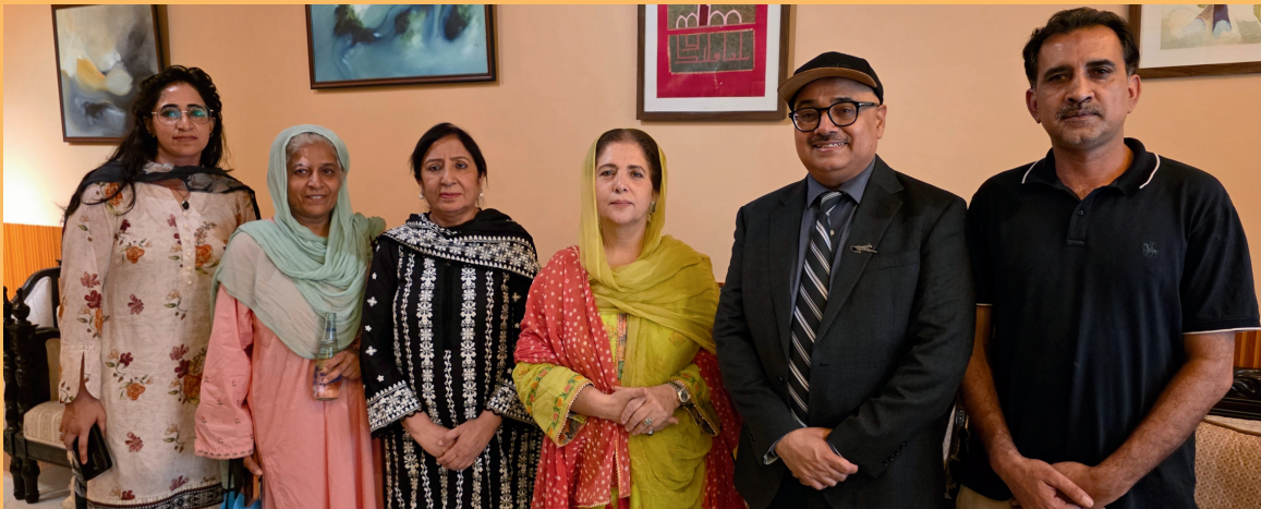
Standing for wildlife, conservation, and collective responsibility