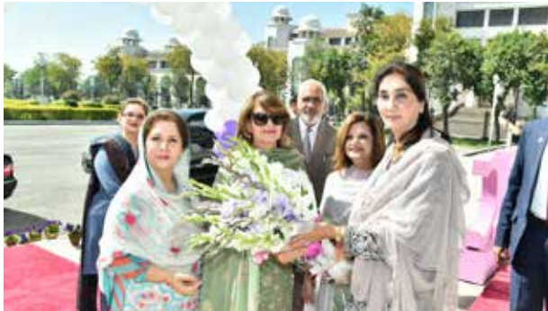
Bouquet being Presented to the First Lady

The opening session of the conference, chaired by the First Lady Mrs. Samina Alvi, was initiated on 1st April 2019 at National Library of Pakistan which is a research library and an oldest cultural institution located in the vicinity of the Constitutional Avenue, Islamabad, Pakistan. The day included a series of speeches, activities and presentations to provide girls with opportunities to learn, grow and succeed.