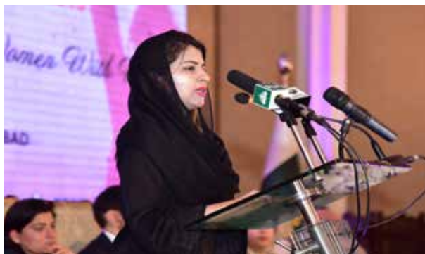
Participant sharing her story with the audience