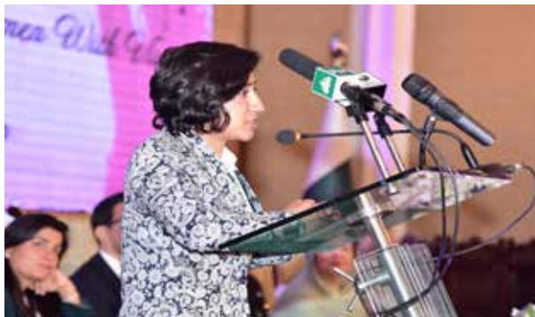
Participant sharing her story with the audience