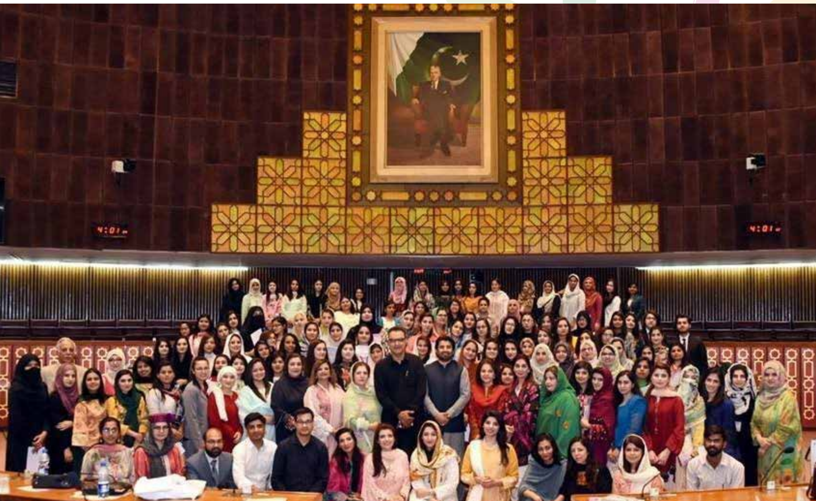
Participants of “Young Women Leadership Conference” at Parliament House with Deputy Speaker National Assembly Mr. Qasim Khan Suri on 02-04-2019.