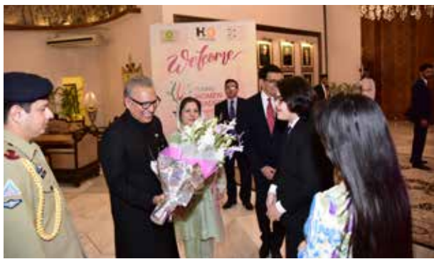
Bouquet being Presented to the President of Pakistan

The day two of the conference was held at Aiwan-e-Sadr, which is situated in Islamabad and is the official residence and office of the President of Pakistan. Due to its wide premises and interior that creates a striking contrast with its exterior, Presidency is the most esteemed and prestigious place for organizing national events.