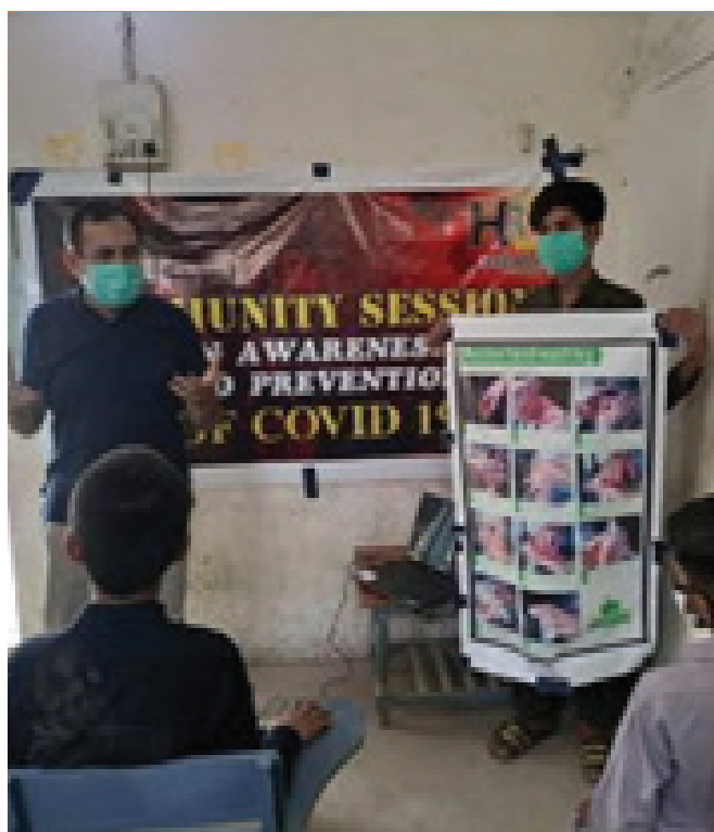
Provincial Events: Number of events and participants

HRDN supported the Sanitation Project, "Institutional support for national coordinator". The project was mainly to support the NC for strategic role to supervise the implementing partners for WASH activities for improved sanitation and hygiene programming and sector coordination, strengthening advocacy, access to funds, link to international campaigns or otherwise to use WSSCC international profile in Pakistan. Under this programme, the WSSCC role and performance in Pakistan was highlighted, country level sanitation and hygiene engagement of WSSCC was promoted through efficient grant management. The programme was initiated in august 2018 with yearly extension and ended in December 2020. HRDN ensured full support to NC for her activities to identify, leverage and mobilize national level partner resources for implementation of CEP- related activities as per TORs. The project was successfully completed by December 2020.